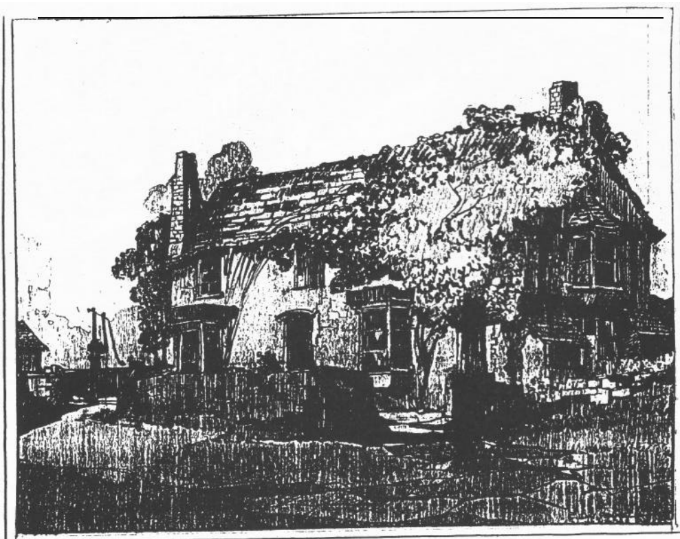
A sketch of the farmhouse in 1945 by C L W Pannell

In 1790 Digbeth was a medium to small farm of little over twenty-three acres. Its boundaries followed the present-day line of Mill Lane from a point near the Kalamazoo works, to the railway bridge at the bottom of Quarry Lane, along Coleys Lane, up to Turves Green, along to the row of shops by The Oak Walk and from there in almost a straight line back to Mill Lane.